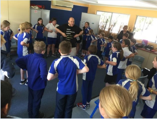
WA Opera workshopping our students on singing.