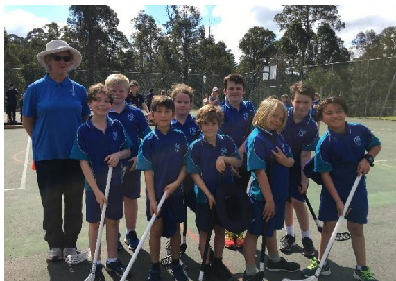
Walpole PS Hockey Team