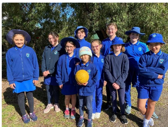
Walpole PS Netball Team