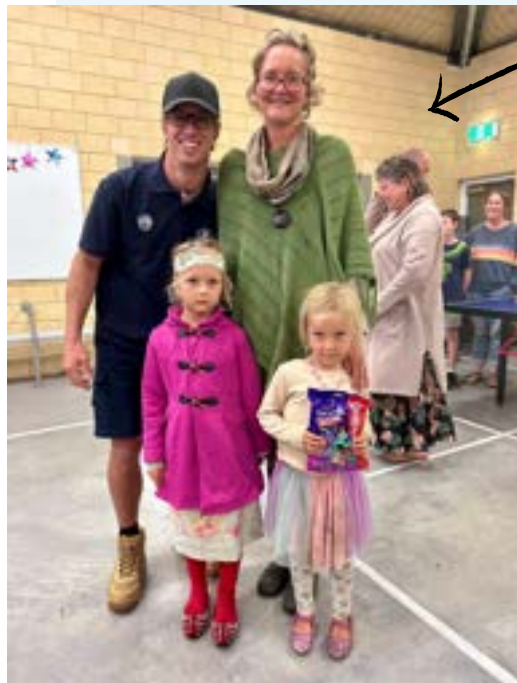
Winners - Tower Challenge, The Smith Family

The STEM night was attended by more than 60 people. We are all looking forward to the next one.