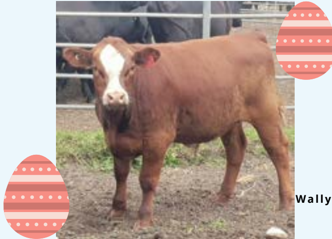
Wally at the start of the year

Wally and a few of his buddies are growing a little on the slow side. They have been hanging out and munching grass, silage and hay out in the big paddock. Watching the local roos & emus, kicking up their heels and having fun. With the new winter grass growing rapidly they are on track for heading to sale in a few weeks. Eat up Wally!